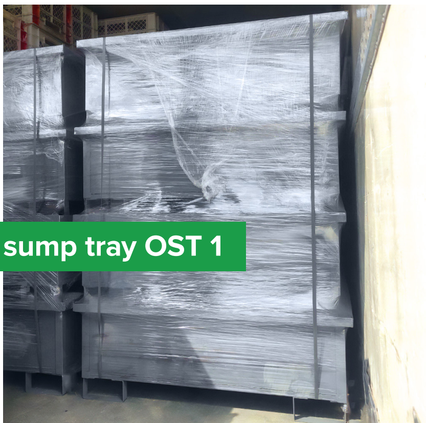
Oil sump tray OST 1